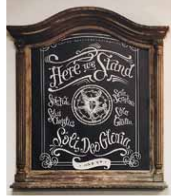
"After" photos by Lucas Roybal "Before" photos by Julia Buehl

The ONE28 room, where the junior and senior high students meet, was revamped over the summer with a fun industrial look. The room is located upstairs in the southwest corner of the gym. Stop by for a peek!