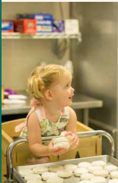
Men's Breakfast...see what's going on behind the scenes. More pictures on page 8.