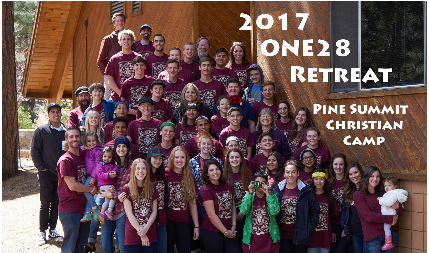
Over 50 junior high and high school students and leaders attended this year's retreat.