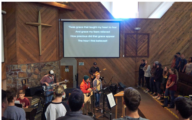
Being used by God with the gifts and talents each has been given, we strive to humbly bring God the praise he deserves.

This year marks 500 years since Martin Luther nailed his 95 theses to church door in Wittenberg, Germany. This act symbolically represents the start of the Protestant Reformation, the event that shook the entire western world. It changed the political scene. It gave power to the common man. But most importantly, it recovered the gospel as taught by Christ and his apostles.