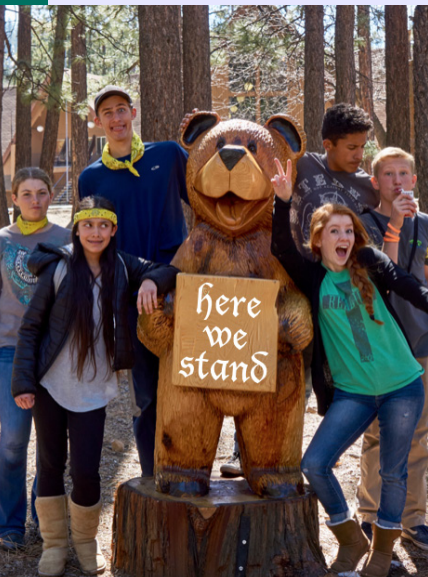
ONE28 Retreat...more pictures on page 8