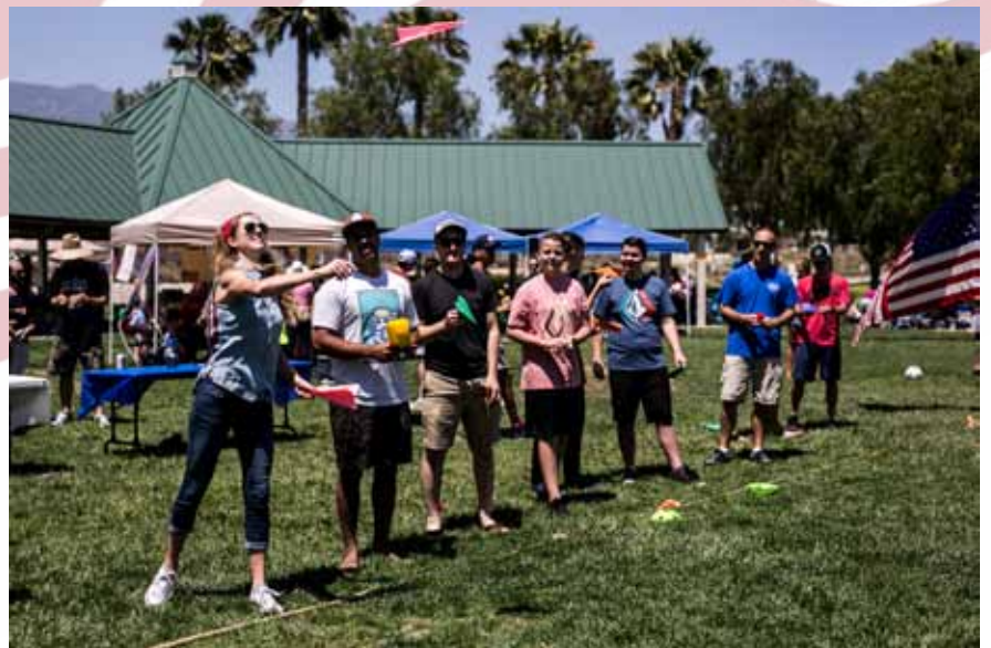
PAPER AIRPLANE FLYING CONTEST