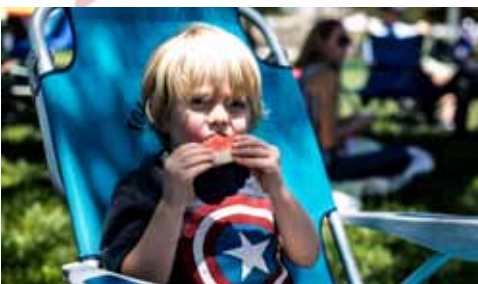
A BEAUTIFUL DAY