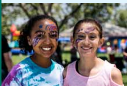
Memorial Day Picnic More pictures on page 10.