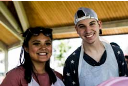
COTTON CANDY MAKERS