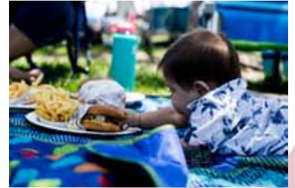
BURGERS AND FRIES FROM THE HABIT