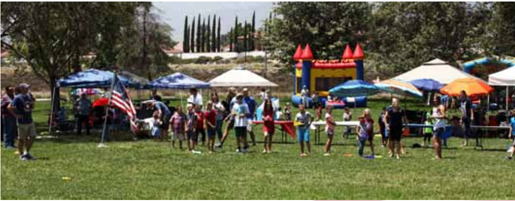
LET THE FESTIVITIES BEGIN!