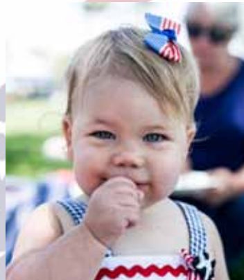
RED, WHITE AND CUTE