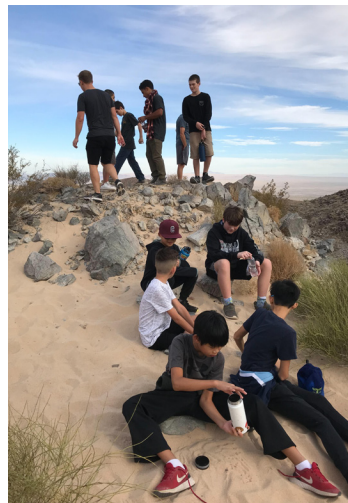
ONE28 students hiked to a place to sandboard on the desert dunes.

should never try to rush our lives because everything is in the hands of God.”