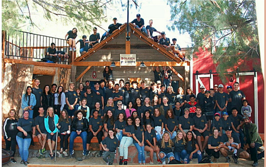
ONE28 Retreat