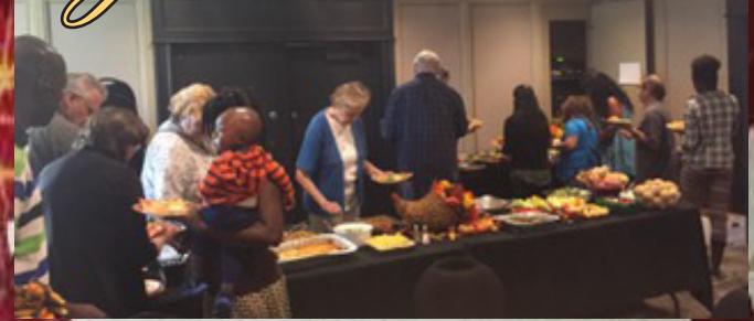
Twenty-five people gathered at Foothill Bible Church on Thanksgiving day and enjoyed a bountiful selection of delicious dishes including, of course, turkey and a ham.