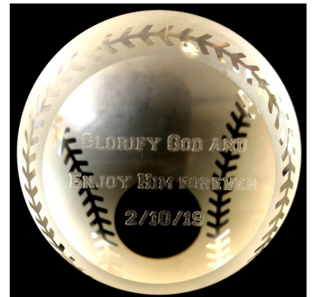
"Glorify God and enjoy him forever 2/10/19"

It is the contemplating of enjoying God forever that puts all the trials and tribulations of today into perspective. I think of the times when I have felt closest to God, like mountaintop experiences or moments of connection with others. It takes some effort to dwell on those moments without immediately countering, "yes, but..."; however, when I do, I get really excited about who God is and what it will be like to spend eternity in