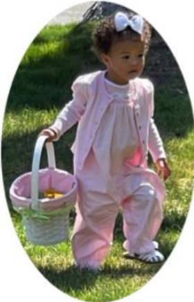
Hunting for Easter eggs

A look back at some of the fun we've had over the past month, including Easter, our visit with the KLDP, and Mark Twain and the Gold Rush Gals!