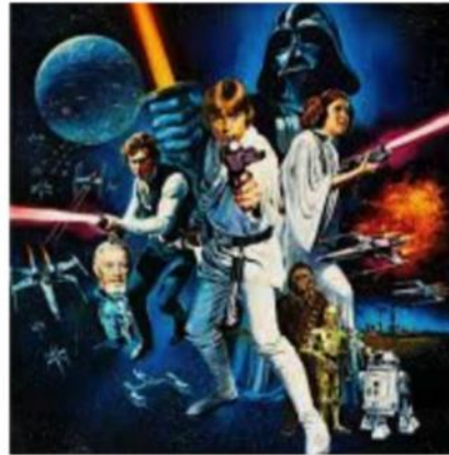
October 15 Star Wars Movie Night Come in Costume!

October 16 Lattin Farms in Fallon Corn Maze, Hay Ride, Picking Pumpkins, Make your Own Scarecrow