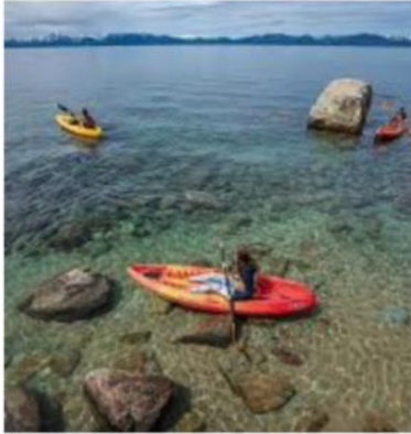
September 18 Sand Harbor Beach/Kayak Day (Subject to Change)

We have wrapped up summer, and with it so many fun times. But the gatherings aren't ending just because we have to say goodbye to long, warm days. There is plenty more to look forward to!