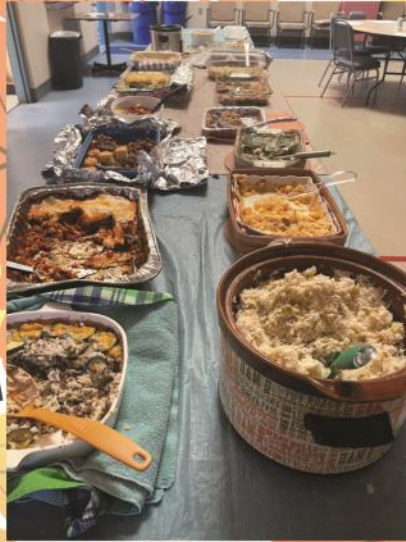
So much good food!