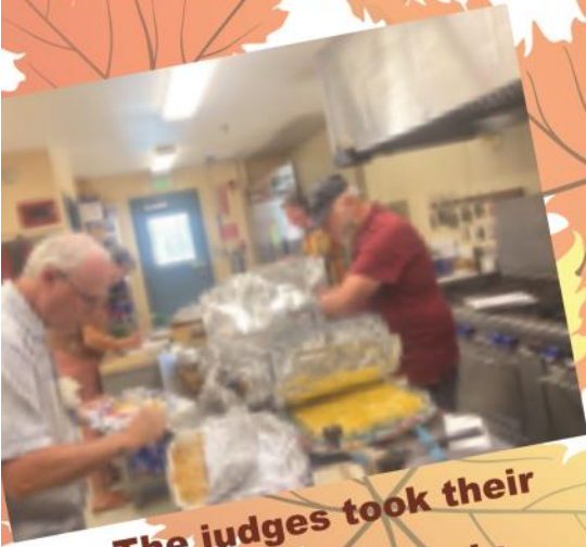
The judges took their job very seriously.