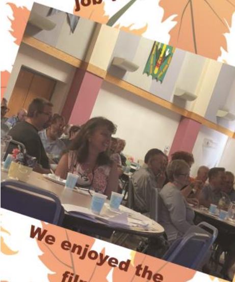
We enjoyed the films.