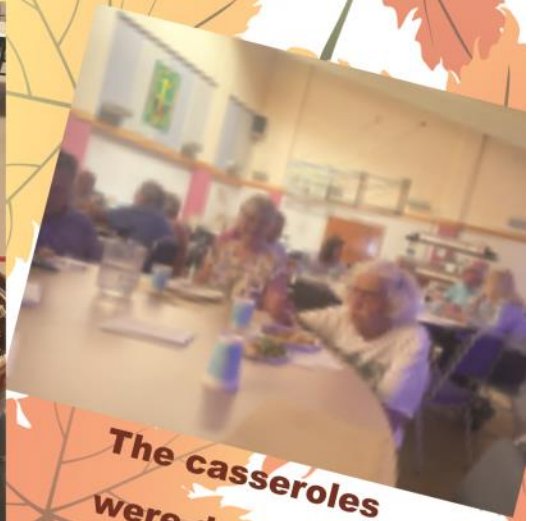
The casseroles were delicious!