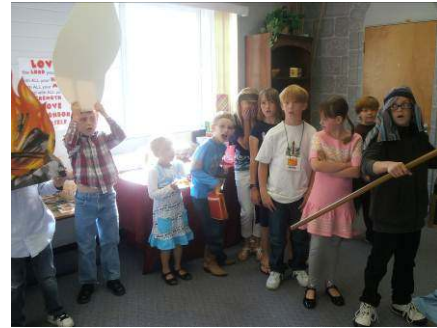
Crossing the Red Sea