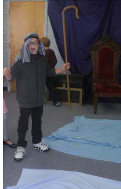
Moses: "Hey, God parted the waters of the Red Sea!"