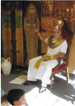
Pharaoh would not let the Israelites go!