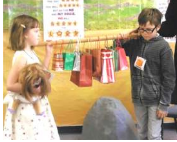
"Spies in Training" (the Kids) looked for fruit in the Promised Land, and loaded it onto a big pole like the one the Bible spies had.