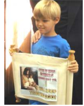
Big Idea: Even when others choose not to, I will keep trusting God!