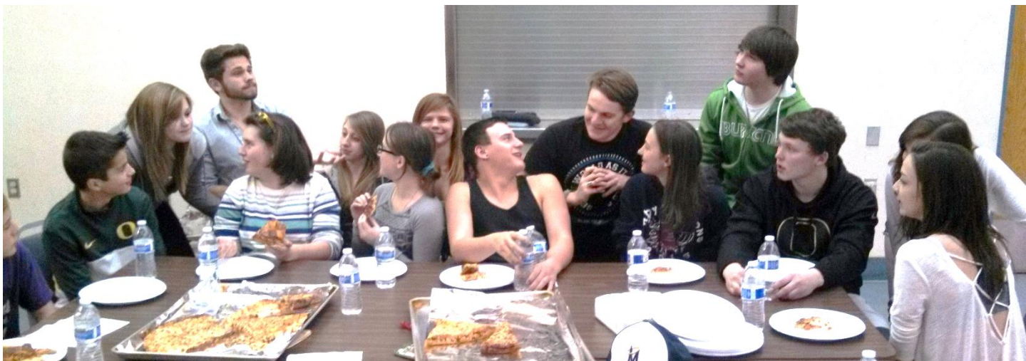
Enjoying leftover pizza at youth group

We have been working our way through The Story along with the rest of the church congregation. Many of our kids are hearing about God's faithfulness in history for the very first time. We have been putting a special emphasis on praying for each other and for our friends and family during our youth groups, and it has been very rewarding to watch us get more comfortable with turning our hearts towards God. We had eleven kids attend the inaugural Youth Winter Retreat at Zephyr Point – and we had deeply meaningful and fun time.