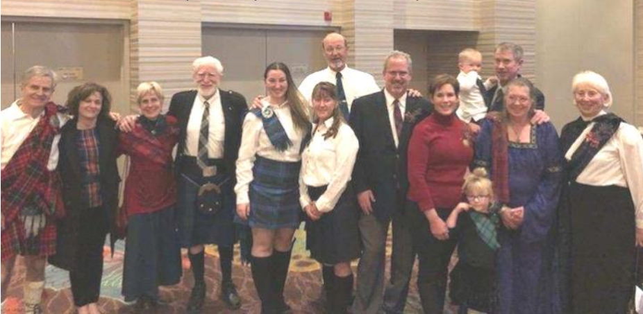
Robert Burn's Dinner, put on by the Nevada Society of Scottish Clans