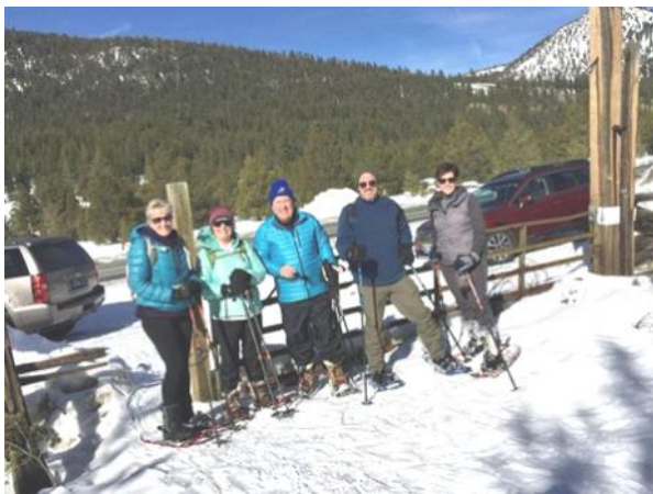
Hope Valley Snowshoeing with the Bergers & Hataways

SPRING HOUSE CLEANING?? Are you finding good treasures that you no longer use? Set them aside—we will be holding another rummage/garage sale in June. More information coming soon!