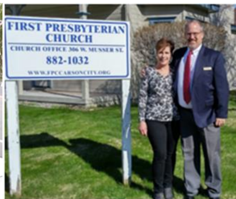
On their first day at FPC