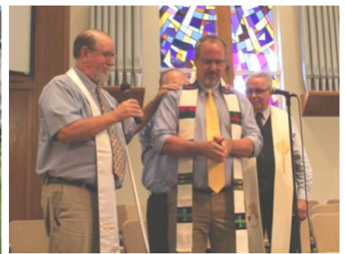
Ordination as an ECO pastor