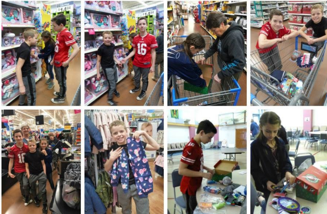
Shopping for Operation Christmas Child

We filled close to 100 shoeboxes with Christmas joy! They were delivered and will be sent to kids around the world, sharing the GOOD NEWS of the SAVIOR!