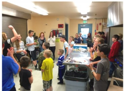
YOUTH GROUP GAME NIGHT

I am blessed to be in this position as Youth Pastor. I give Him all the praise and glory for the relationships being built, the students' growth in their faith, the support from the church and youth leaders, and most of all for the IMPACT Christ is making in so many lives.