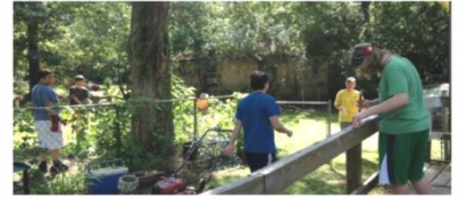
SAN DIEGO MISSION TRIP (7/31-8/5)