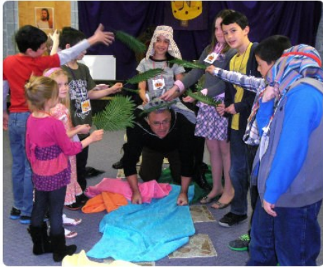
Jesus rides into Jerusalem

King's Kids Bible Experience: Palm Sunday lesson