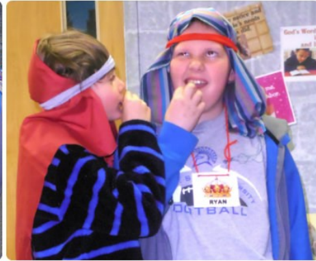
Pharisees start to plot against Jesus