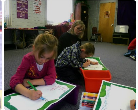
Reflecting on OUR praises