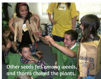
Other seeds fell among weeds, and thorns choked the plants.