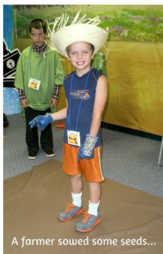
A farmer sowed some seeds...

Excerpt from thank you note from First Love International: "Because of your generosity, we have been able to meet the needs of many immediately. Our longer range desire and plan is to choose a village and rebuild homes for those who have lost theirs. More importantly, we desire to help them rebuild their lives on a foundation that can never be shaken, the Lord Jesus Christ."