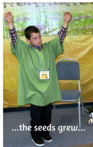
...the seeds grew...