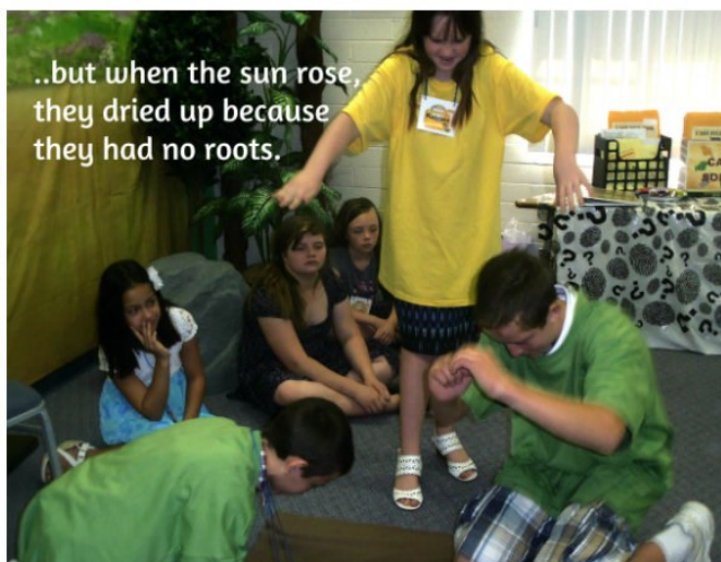
..but when the sun rose, they dried up because they had no roots.