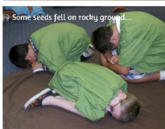
Some seeds fell on rocky ground...