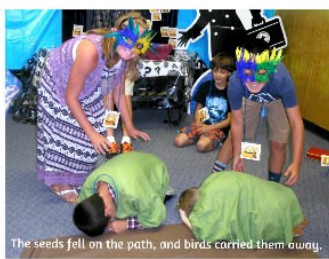
The seeds fell on the path, and birds carried them away.