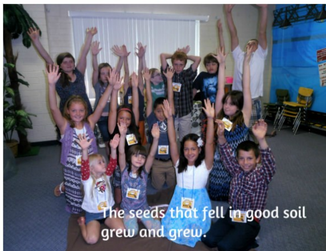
The seeds that fell in good soil grew and grew.