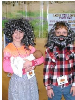
Sarah & Abraham and "baby Isaac"