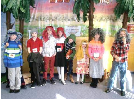
Abraham's family moves to a land he does not know.