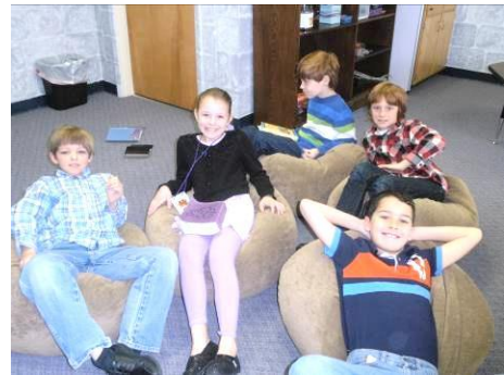
Knights in their new beanbag chairs.