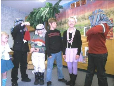
Delilah takes a bribe.