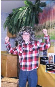
Samson shows his strength.

- Kids experiencing Jesus and community as we walk through God's Story -