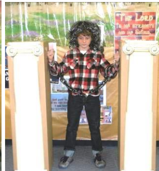
Samson knocks down walls of the pagan temple.