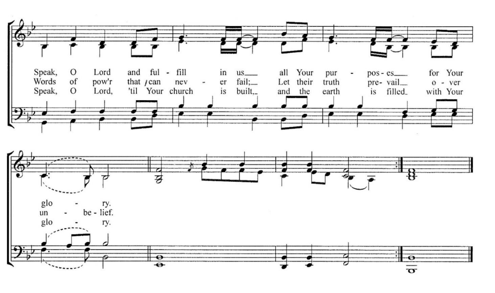
Words & Music: Keith Getty & Stuart Townend © 2005 Thankyou Music. Administration by Capitol CMG Publishing. All rights reserved. Used by permission. CCLI # 4615235