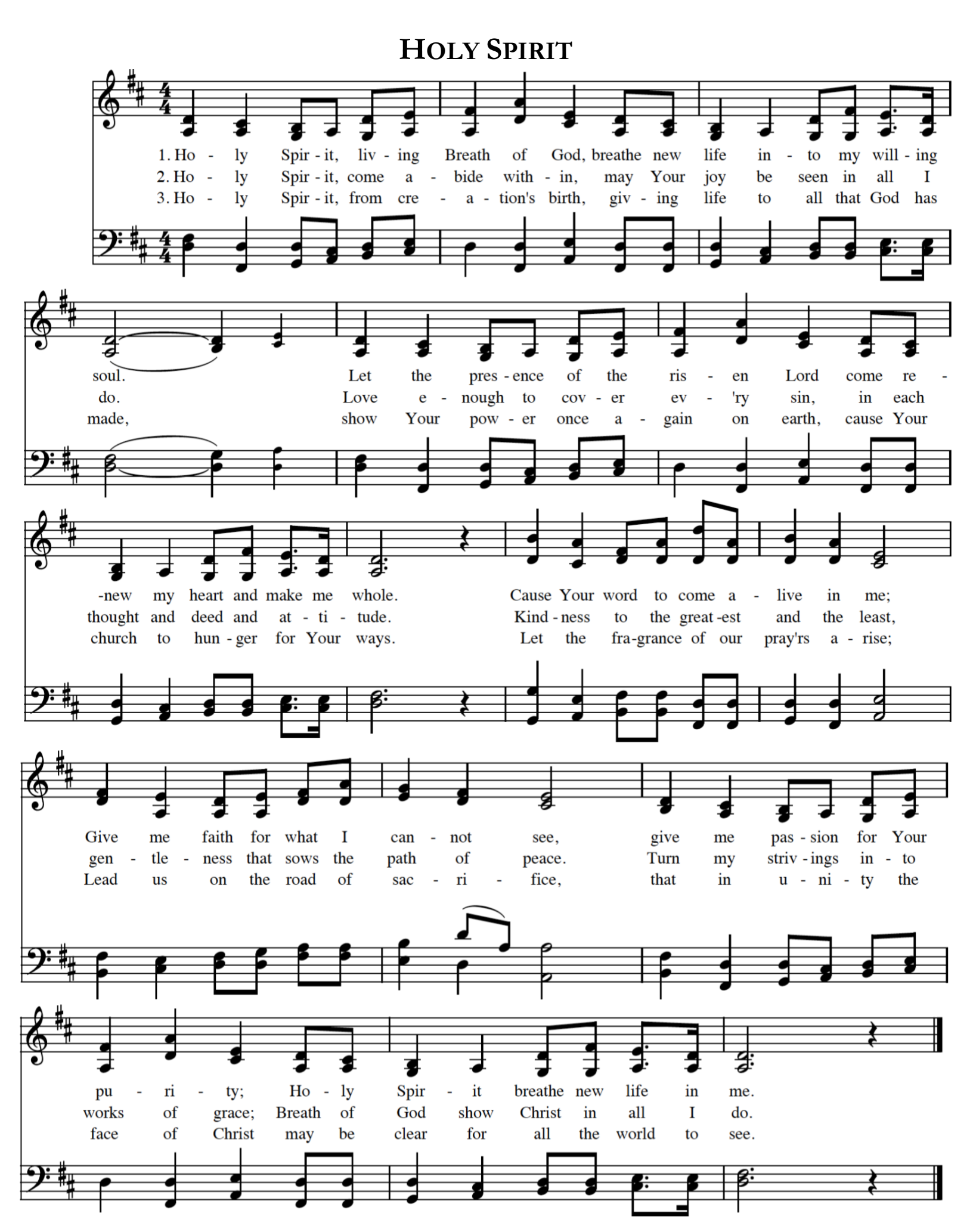
Words & Music: Stuart Townend and Keith Getty ©2006 Thankyou Music. CCLI #4479872