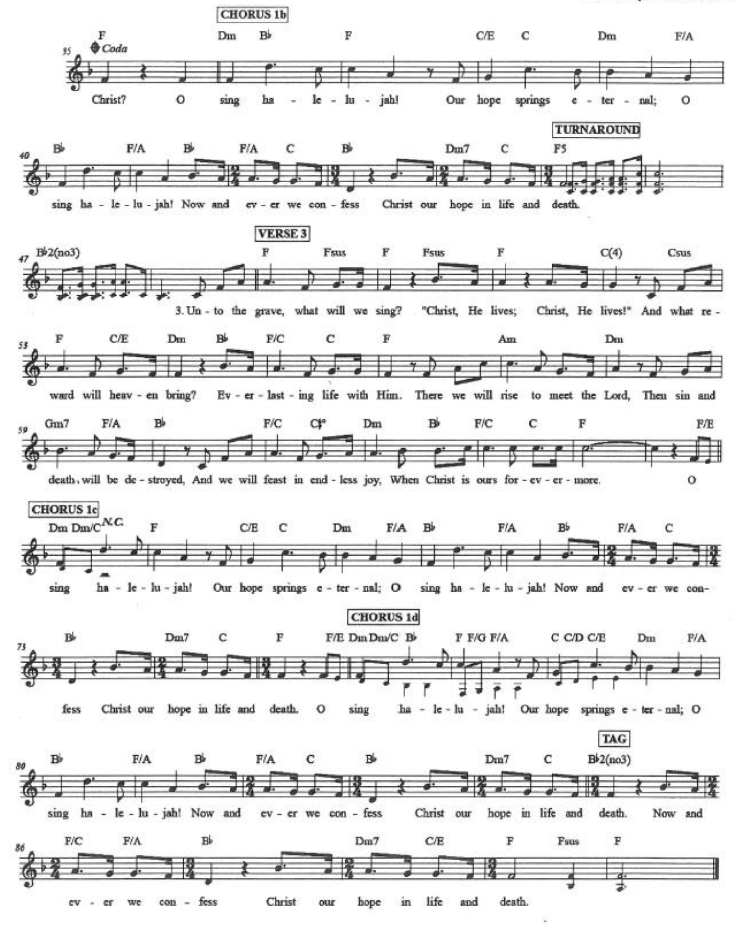
Christ Our Hope In Life And Death - 2