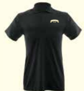
Leader Polo Shirt