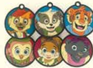
Character Name Tags