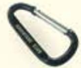
Name Tag Carabiner