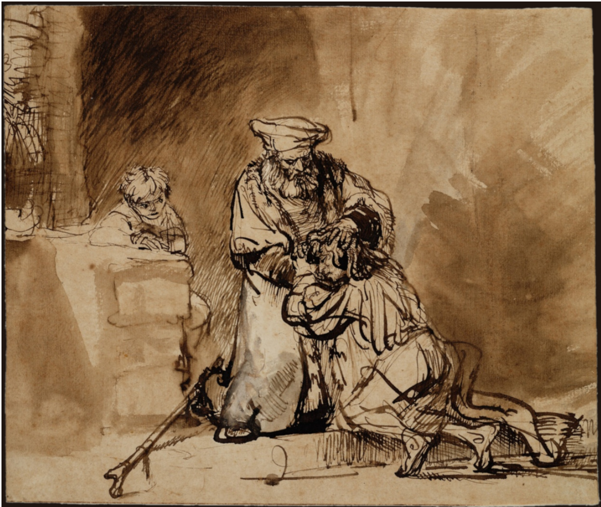
"The Return of the Prodigal Son" by Rembrandt Harmensz. van Rijn