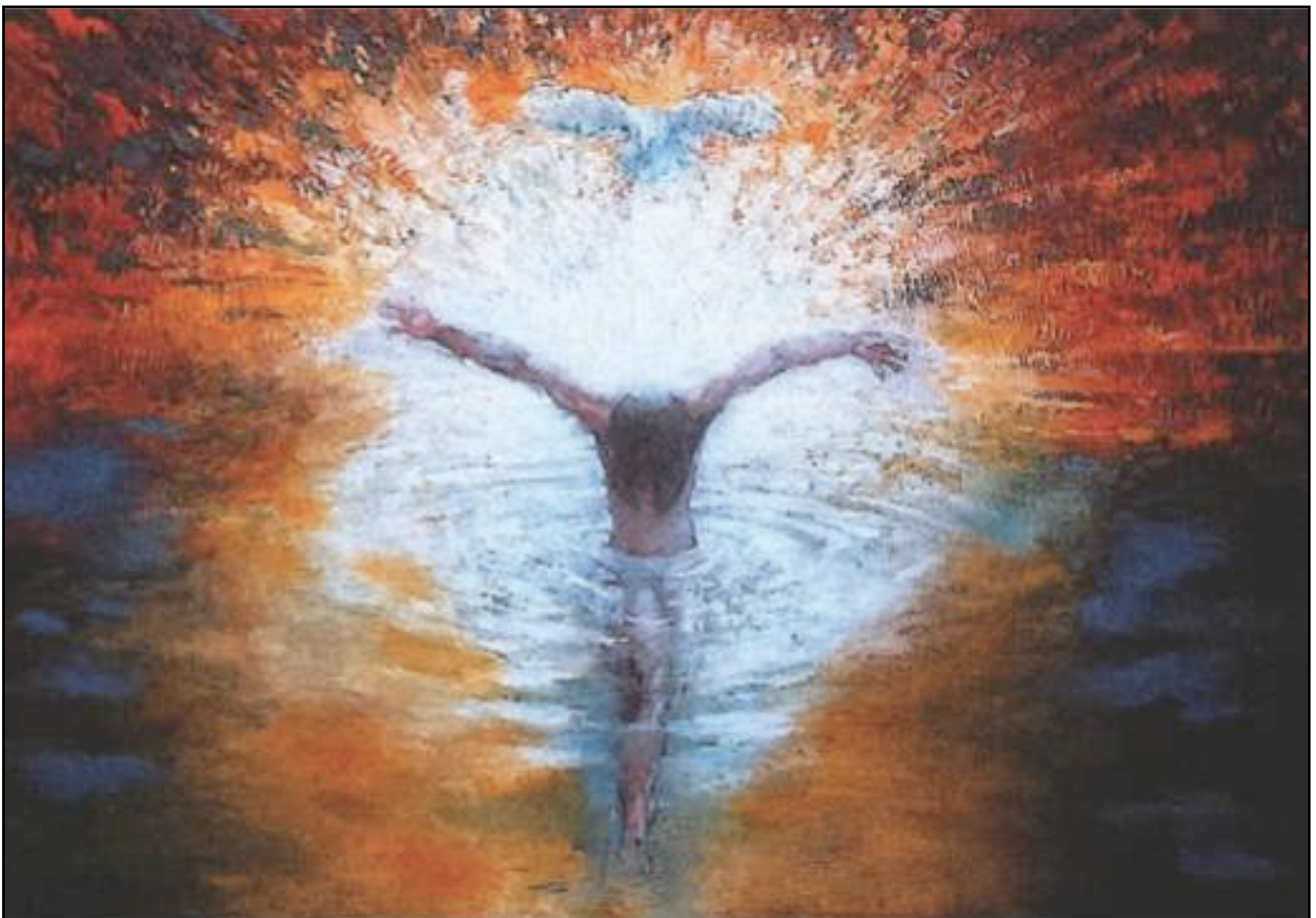
BAPTISM OF THE CHRIST #2—DANIEL BONNELL, WWW.BONNELLART.COM (USA/CONTEMPORARY)