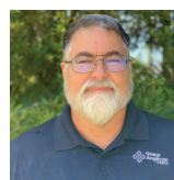
Rocky Shearin Campus Support