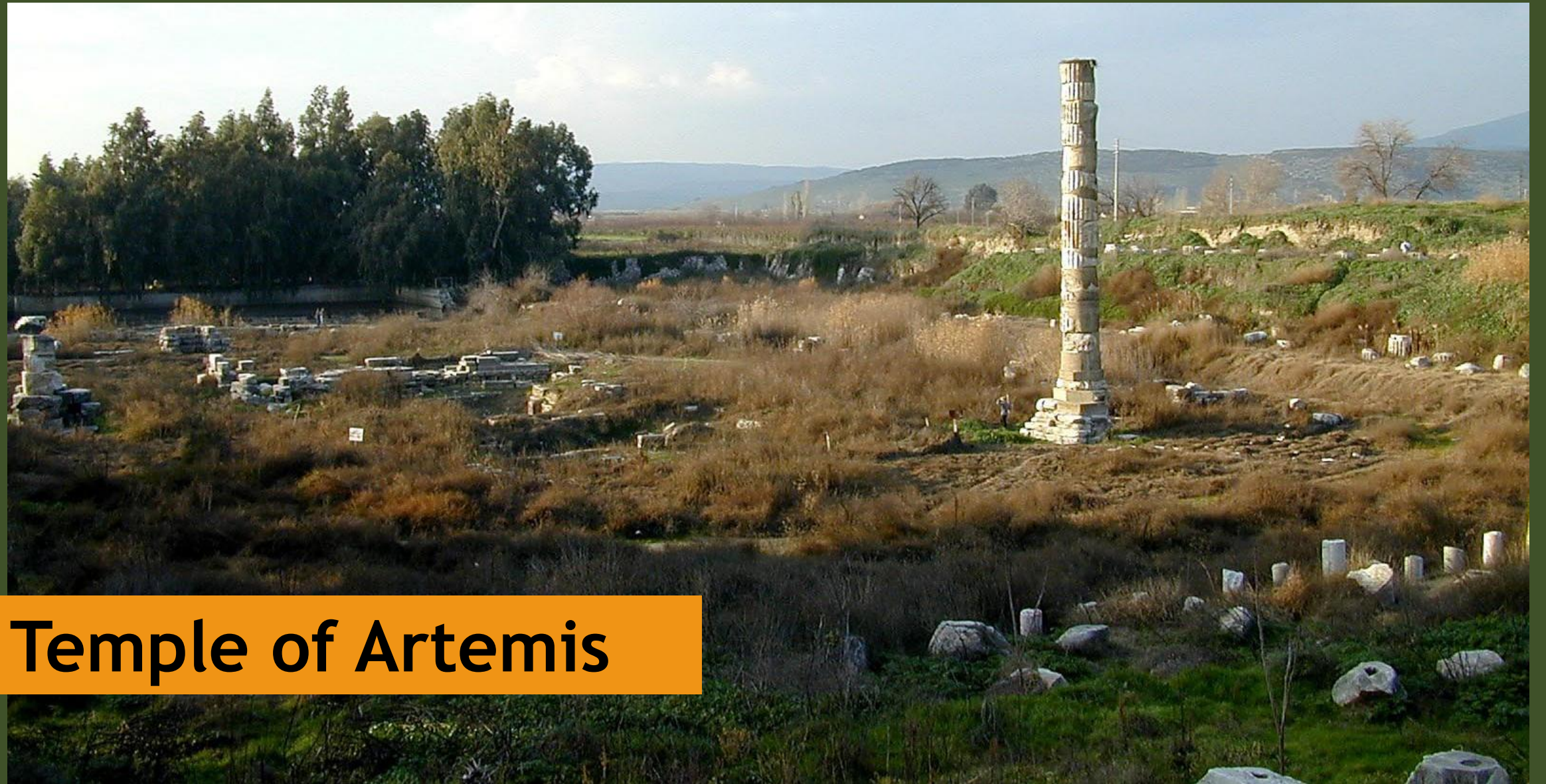
Temple of Artemis