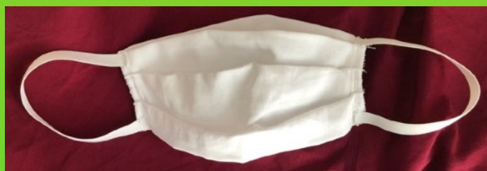
Here one of the washable masks made in town!

We were able to donate all the fabric needed for those masks, since we received our selves loads of excellent linen quality fabric it in summer 2019, when a dear brother from Switzerland brought brand new bed wear to the Camp.