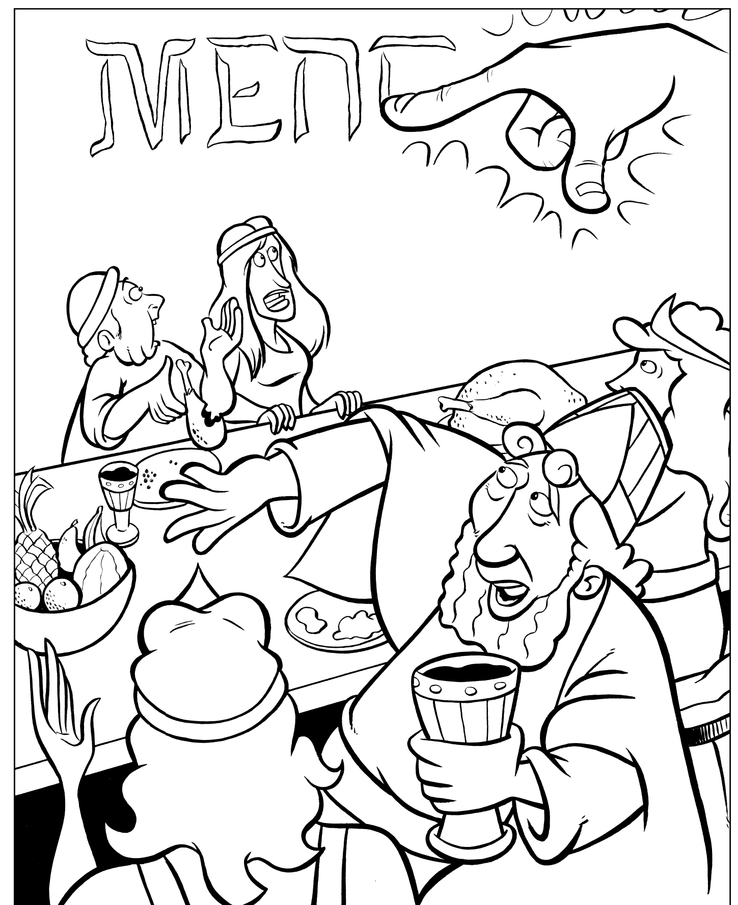
"In the same hour the fingers of a man's hand appeared and wrote opposite the lampstand on the plaster of the wall of the king's palace; and the king saw the part of the hand that wrote" (Daniel 5:5).