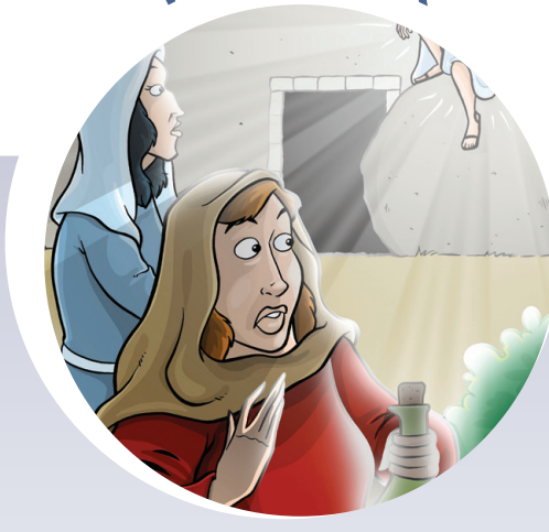
God forgives David Mark 16:1-8