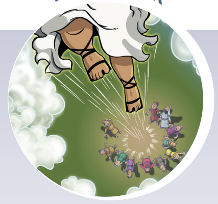
Jesus returns to heaven Acts 1:1-11