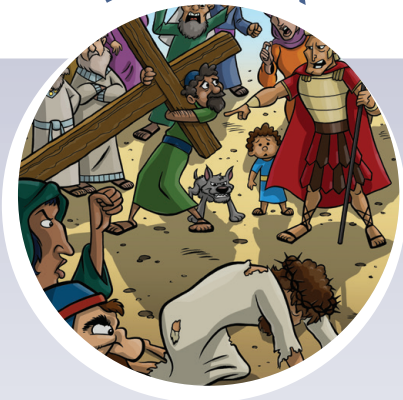
Jesus endures the cross Mark 15:16-47