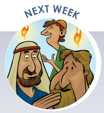
The Holy Spirit arrives Acts 2:1-47