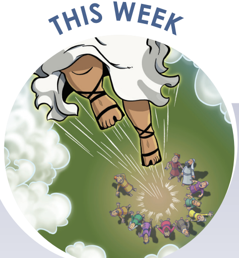
Jesus returns to heaven Acts 1:1-11