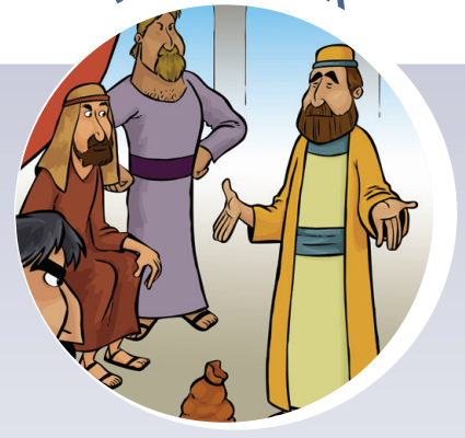
Ananias and Sapphira lie to the Holy Spirit Acts 4:32–5:11