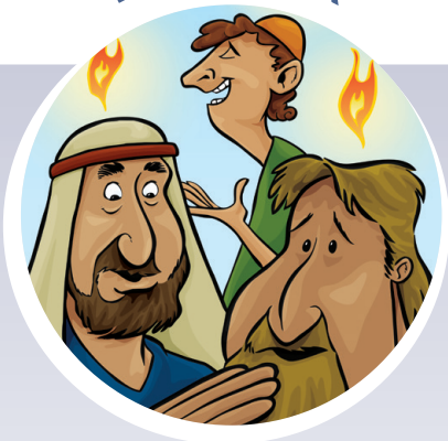
The Holy Spirit arrives Acts 2:1–47