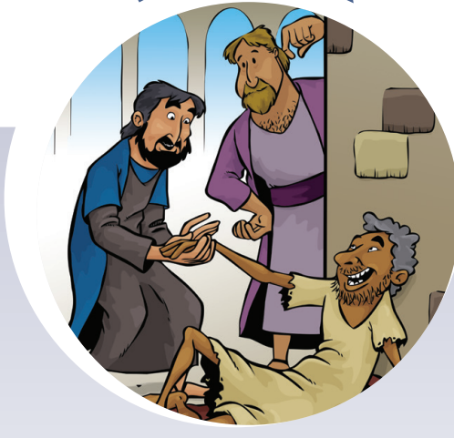
Peter and John preach the gospel Acts 3:1–26