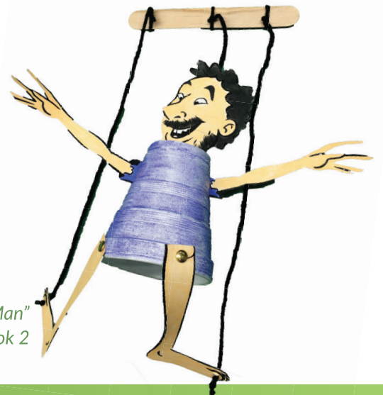
Puppet "Lame Man" See Year 3 Craft Book, Book 2

Directions: copy the craft page on cardstock. Color image, and cut them. Color the cup. Make a hole on the top for the head and two holes on the sides for the arm. Fix the legs with a brad. Tie three pieces of yarn to the craft stick. One is of the head, the other two for the legs. Make a hole in the feet, and tie the yarn.