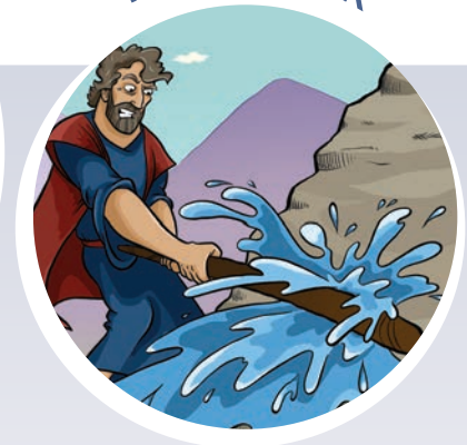
God preserves Israel Exodus 15:22–17:7