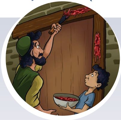
God ordains the Passover Exodus 11:1–13:22