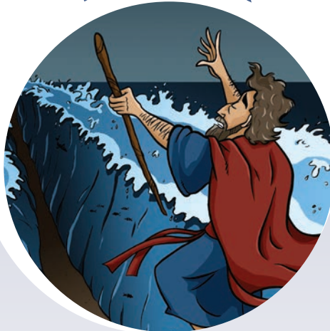
God parts the Red Sea Exodus 14:1–15:21