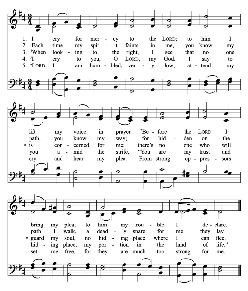
<sup>7</sup>LORD, out of bondage bring my soul, that I may give your name all praise. The righteous then will join with me, for you have shown to me your grace.

OPC/URCNA 2016 © 2018 Trinity Psalter Hymnal Joint Venture