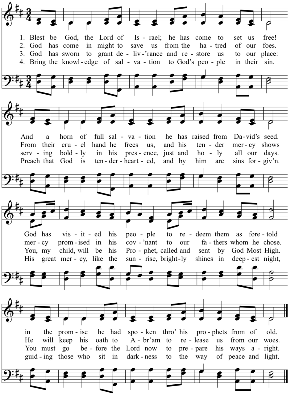
From Luke 1:68–79 Vers. OPC/URCNA 2016 © 2018 Trinity Psalter Hymnal Joint Venture

NETTLETON 8.7.8.7.D. Asahel Nettleton, 1825