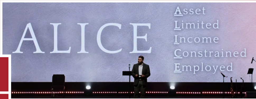
Heart for Winter Haven | Season In Review | Winter 2025