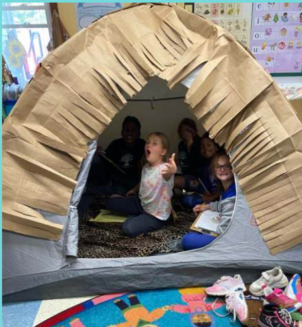
Grade 3 in the wetu they built in their classroom

Hello Grade 4 families! I want to start off by saying how proud I am of your children. We have hit the ground running this year and these students have really shown flexibility, perseverance and the joy they have for learning. I am so proud of the hard work they put into our first major project, the Plimoth Preview. Each house, costume and presentation was so unique and thorough. It was a wonderful way to prepare not only our class, but the whole school the day before our Plimoth Patuxet field trip. The field trip and Plimoth Preview were both a huge success and the 4 th graders should be especially proud of their accomplishments and hard work. We are going to use the momentum we have built to drive us toward the end of Term 1 and beginning of Term 2. We have many more experiences to prepare for like the Noah play and our Thanksgiving Reenactment. Be on the lookout for emails as we get closer to these events as they will have important information for our class. It has been such a joy to work with these students this far and I am excited to see where the Lord guides us in the coming year.