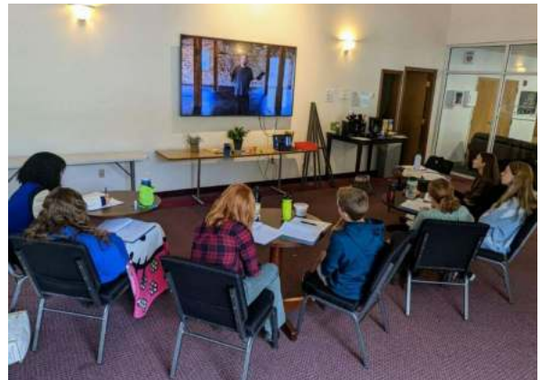
8th Grade leadership conference

Coming up, we will be working out the details of our Plimoth Reenactment which will take place on Thursday, November 10th. Information will soon be sent out about what to wear, what to bring, and other ways to prepare. The student-led worship team is also about to start up again under the leadership of our new music teacher!