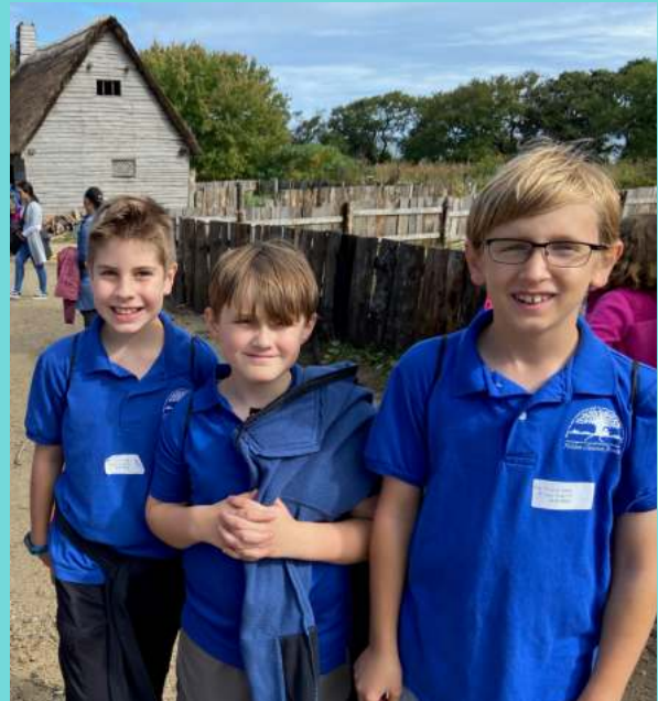
Students from Grade 4 during their visit to Plimoth Patuxet