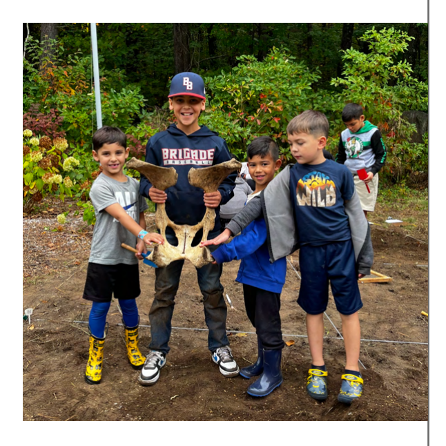
Kindergarten students at the dig!

It's been an exciting start to the school year and we look forward to more fun as we transition to the holidays!