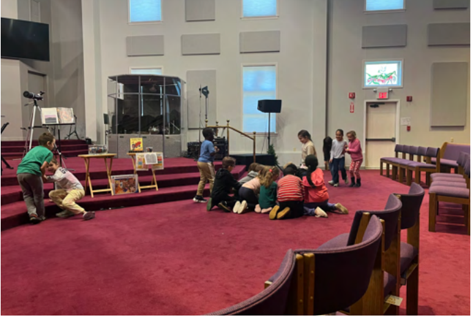
Grade 1 helped out with "What's Wrong with this Picture" during SEW chapel!