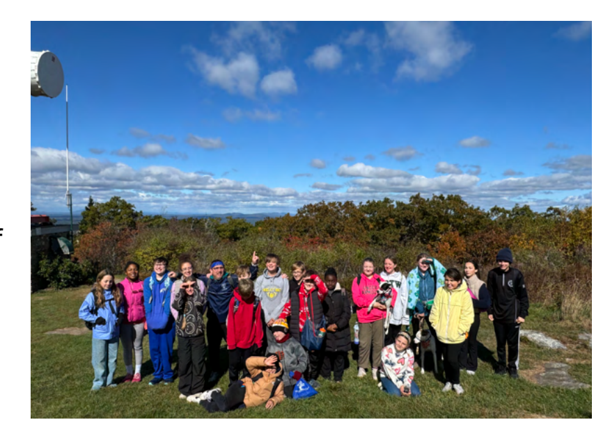
Middle Schoolers summited Wachusett Mtn. during SEW