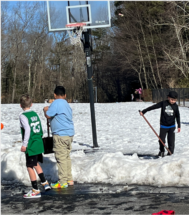
Middle School boys (above) are motivated to remove snow so they can play basketball ;- ) #thinkspring