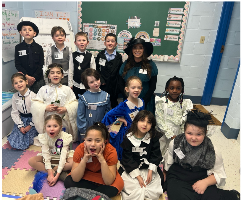
Grade 1 dressed for the CWF!

Finally, your children will be working on a long-term writing project where they will write their own books and have them published! They are very excited to become authors. We are studying “how-to” books where they have to be an expert on a certain topic and teach it to someone (how to score a goal in soccer, how to make pancakes, how to add and subtract, etc.). I can’t wait to see how they come out!