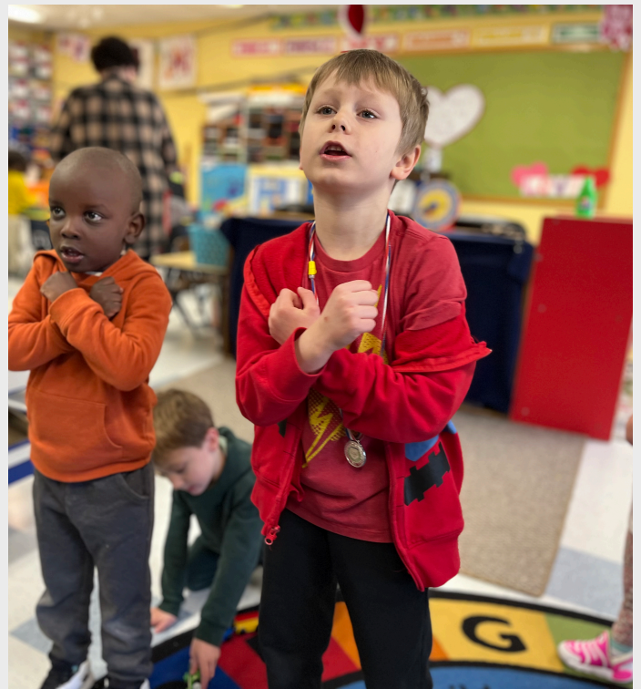
Handmotions while singing in Preschool