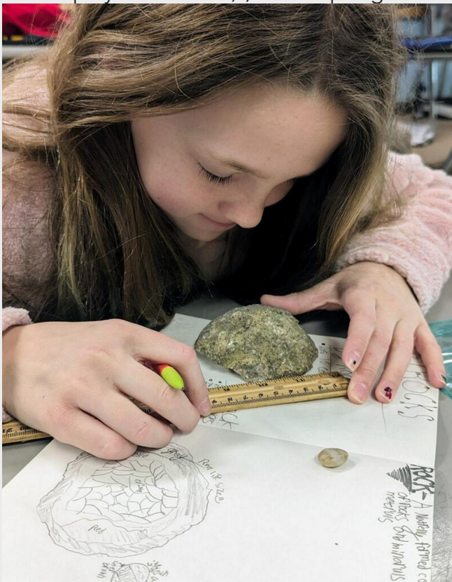
Nature journaling with rocks