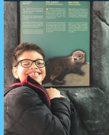
Growing with HCA