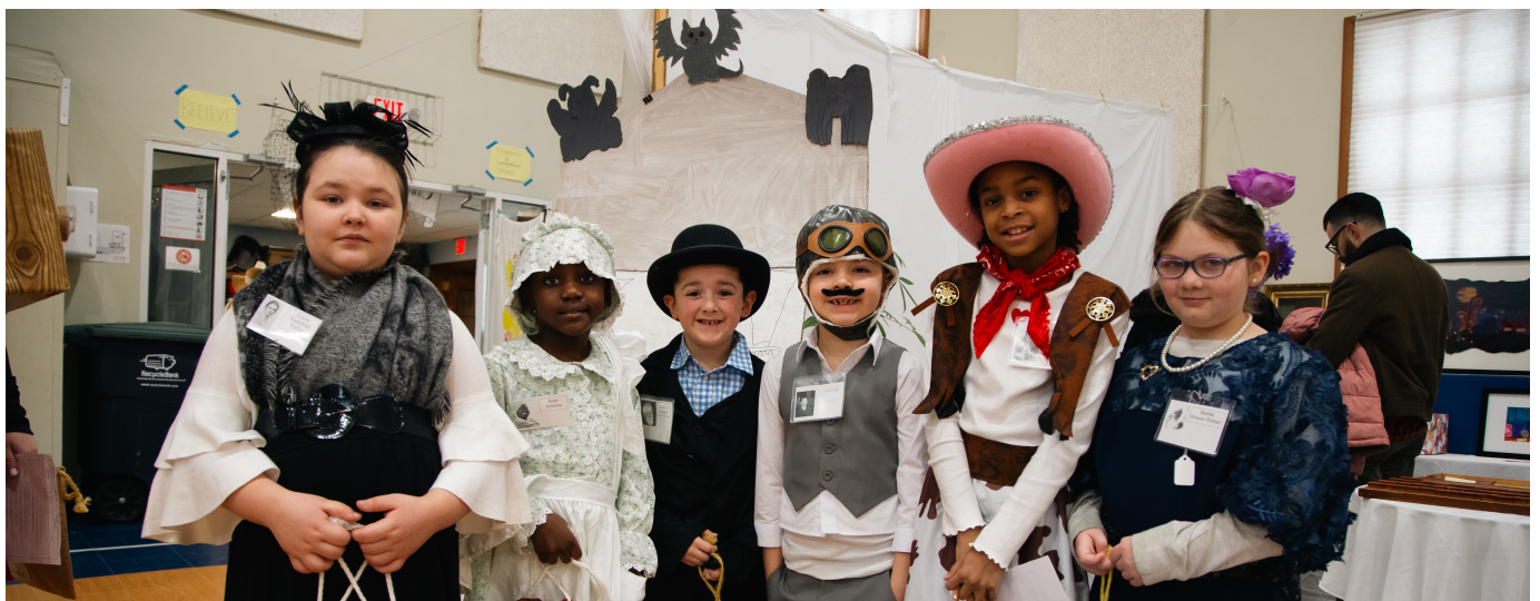
Visitors from the 1893 Chicago World's Fair!