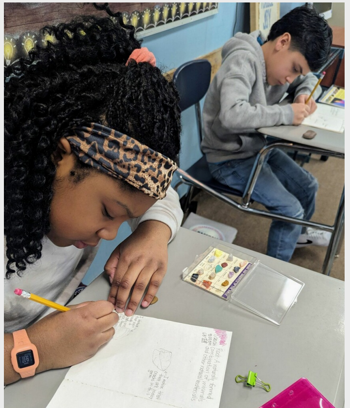
The art of observation