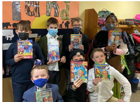
3rd graders recently dressed up for their book reports on Christian missionaries