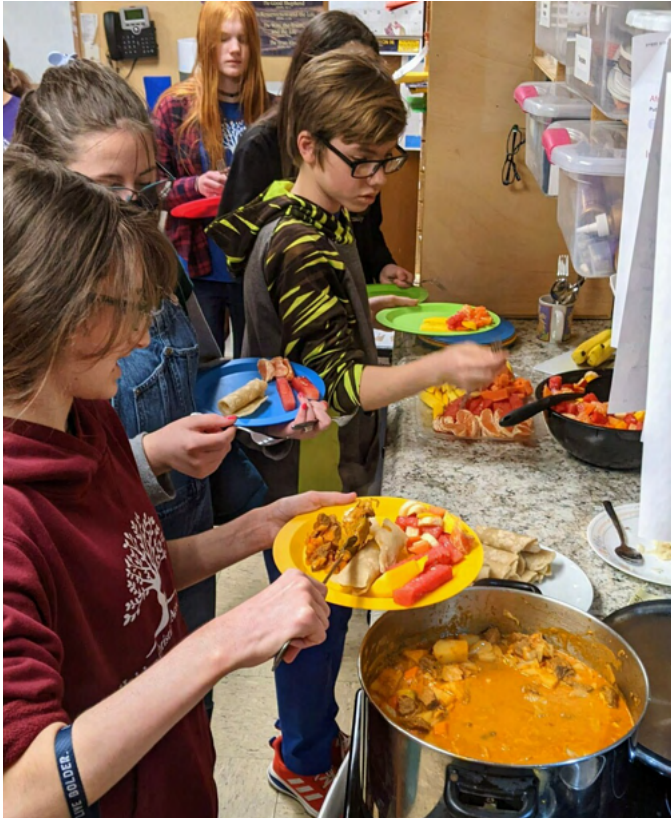
7th and 8th graders cooking a Ugandan dinner together following their field trip!

7th and 8th grade enjoyed a simple and fantastic field trip recently visiting some local African markets, shopping for loads of fresh ingredients, cooking together, and finally dining Ugandan style. This field trip fit in beautifully with studying Ugandan culture, reading through the book Food Rules (which serves as a guide to help people take practical steps away from the Western diet), and experimenting with personal food preferences through an exposure experiment. The students noted these elements of our day as feeling un-American: