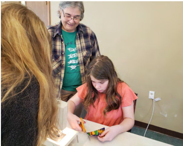
An HCA Grandma shares her talent for sewing with Grade 5

It has been said that it takes over 400 repetitions to create new synapses in the brain (true learning), unless it is done with play...then it takes less than 40 repetitions. I'm looking forward to all the fun and new synapses that will form as this year continues to fly by!