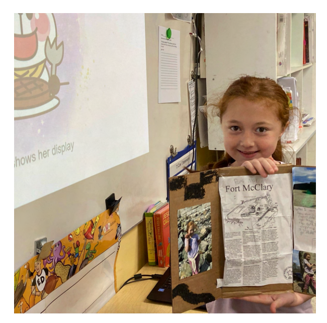
This student shared a Show-and-Tell from her trip to Maine.