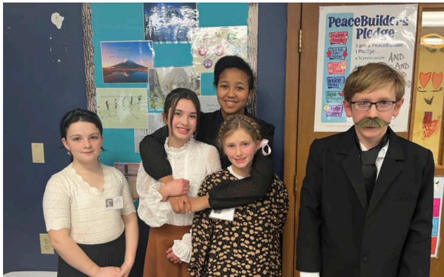
Some Middle Schoolers dressed as their historical characters who attended the CWF in 1893.

I hope you have your tickets. I know this homeroom is looking forward to their final HCA big day and an opportunity to dress up and attend the fair. We hope to see you there!