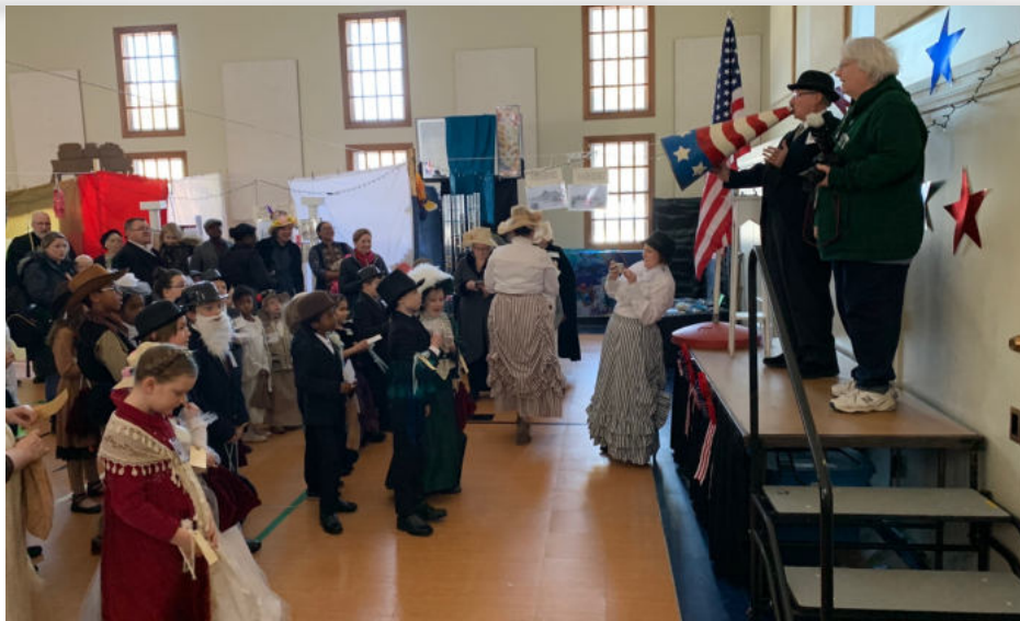
CWF 2020 Opening Ceremonies (more pics on page 5&6)