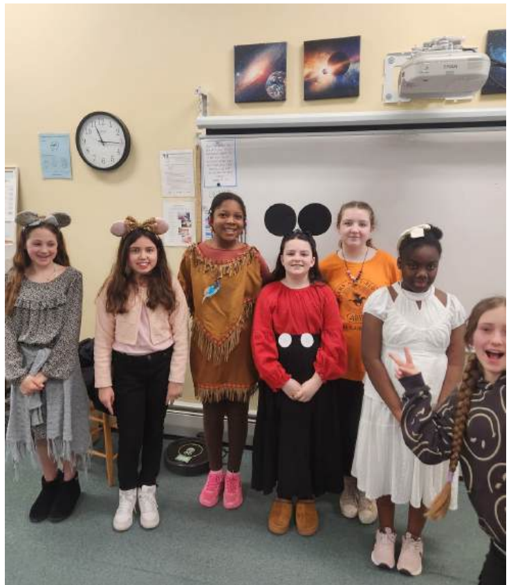
6th grade ladies on Disney Day!

As we near the Medieval Feast, Middle School students will be reading one of the first pieces of written English literature, the epic poem "Beowulf." The story focuses on the importance of community, bravery, and friendship as the hero, Beowulf, fights to defend the meeting hall of an early Anglo-Saxon kingdom. The story highlights the importance of the Medieval Feast and illustrates the hero's journey plot line that we have been learning about throughout the school year. After reading "Beowulf," students will try their hand at creating their own epic poems to perform at the feast. As always, I cannot wait to see what our students will create!