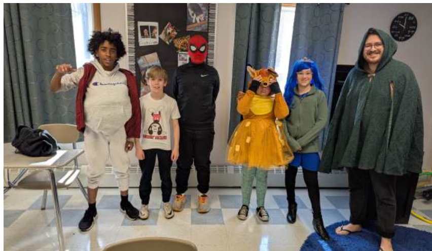
"Disney Day" was a hit in Grade 5 during Spirit Week!