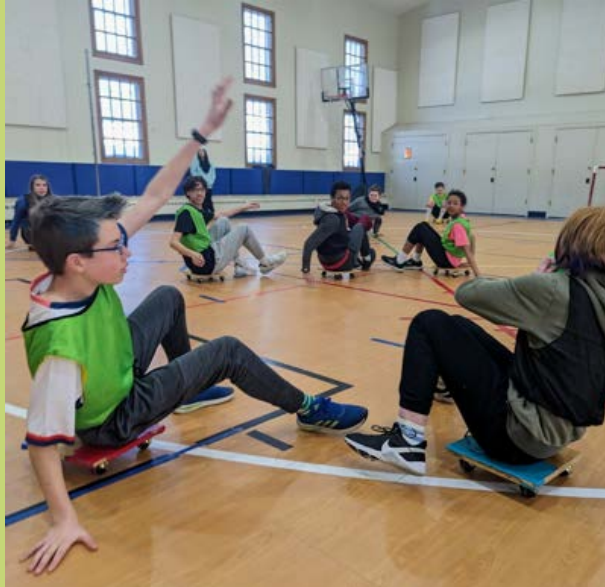
Middle School bonding over scooterball