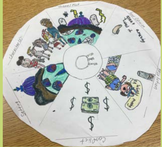
Great drawings accompany a wheel-of-information on the back of this book report!