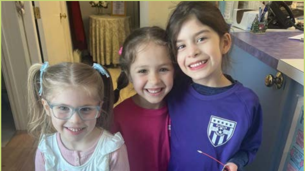
Kindergarten buddies and future lifelong friends!