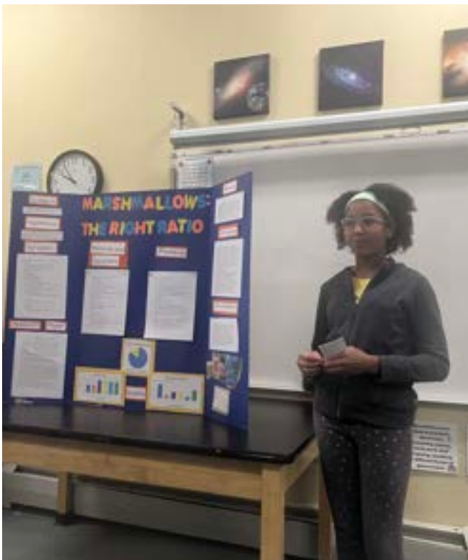
Science Fair Presentations were well done!

I am proud of the hard work of many students and the perseverance of all! I am also deeply grateful to everyone reading this who helped a student in any way with their project. This was a worthwhile endeavor.