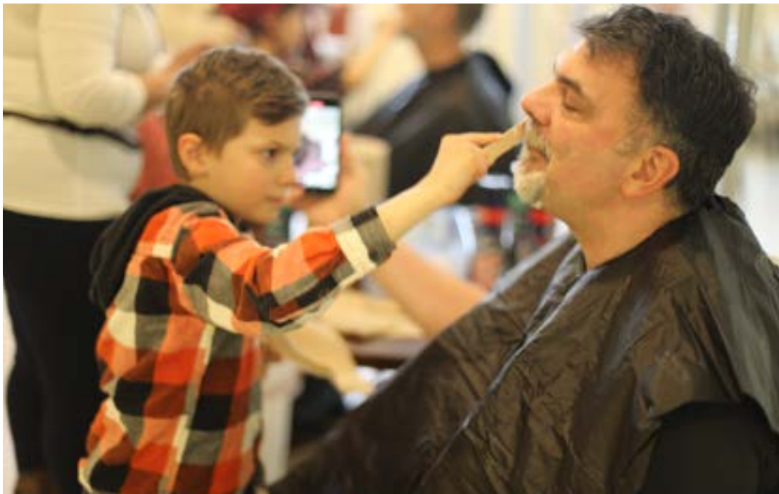
A second grader "shaves" his grandpa during Frontier Day (Frontier Day is featured on page 6)

Upcoming PTC events that we need help with planning a summer get-together!!