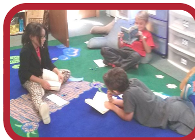
Reading during Book Groups

Fourth grade has been working hard to finish our beautiful "levels of the ocean" box!! They did a great job researching and depicting God's amazing creations.