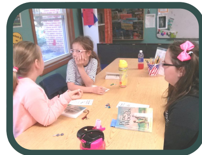
Book Discussion Groups