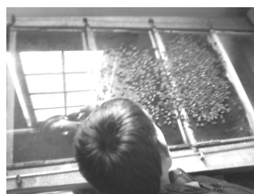
Close up of bees at work at Heifer Project.