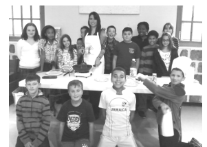
Cooking up flounder, Korean style.