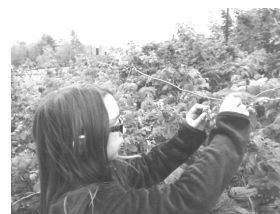
Picking fresh raspberries from the Heifer garden.