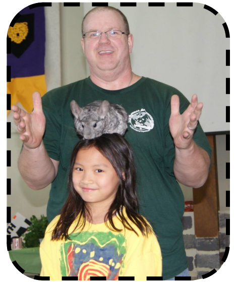
This year, students are voting to decide which exotic animal will visit us!

279 Reservoir St, Holden Ma. ~ 508-829-4418 Questions? Please email info@holdenchristianacademy.org