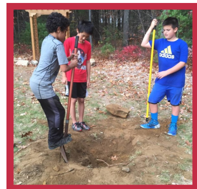
Digging a great big hole for our new apple trees!