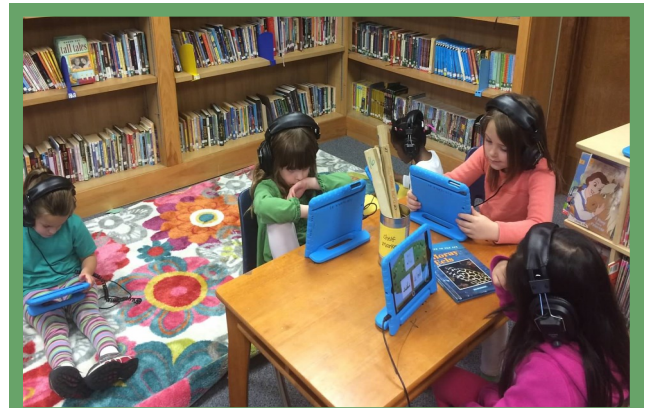
Kindergarten using the iPads for Lexia