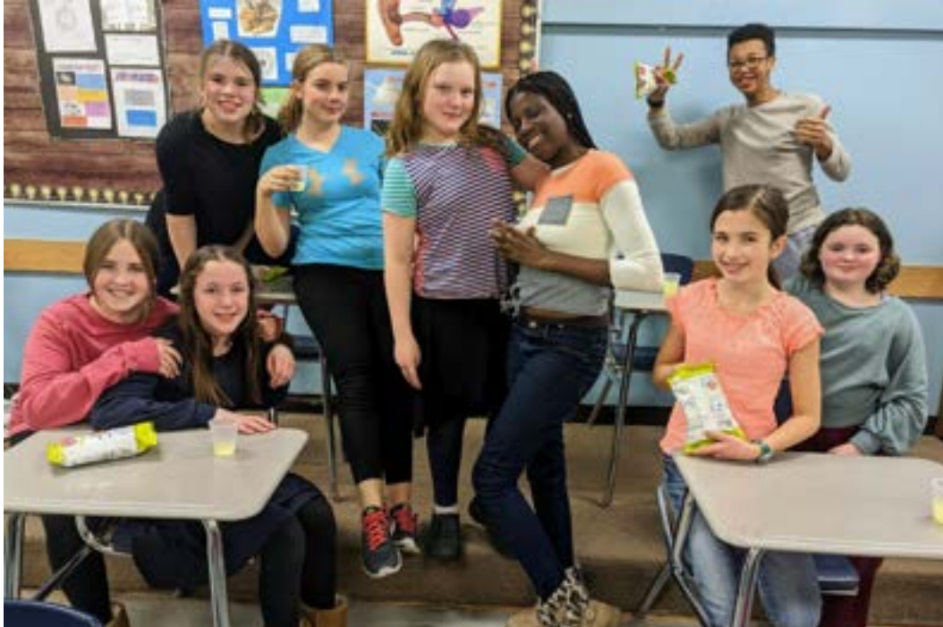
We love our Middle Schoolers!