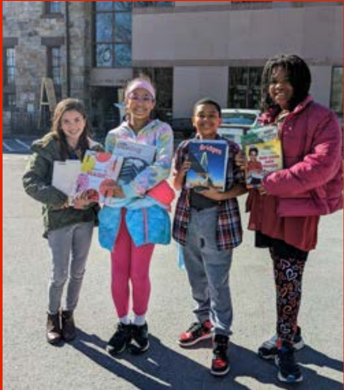
Middle Schoolers recently enjoyed a field trip to the Gale Free Library in Holden.