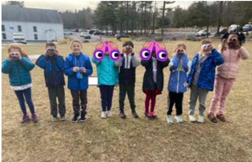
Grade 2 with their "binoculars", trekking the property like Lewis & Clark

I pray you and your family have a blessed winter vacation that is full of fun, relaxation, and fellowship! See you all soon!