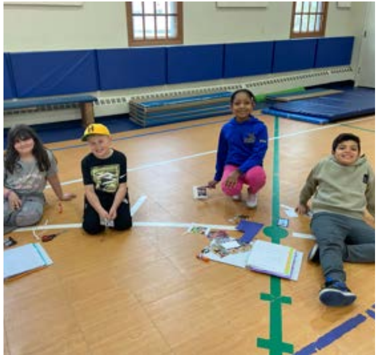
Grade 3 has such a special bond!