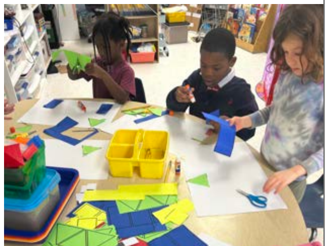
Kindergarteners hard at work!