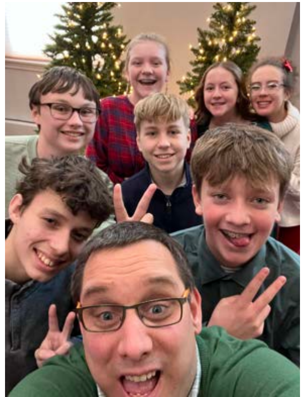
Our soon-to-be graduates!