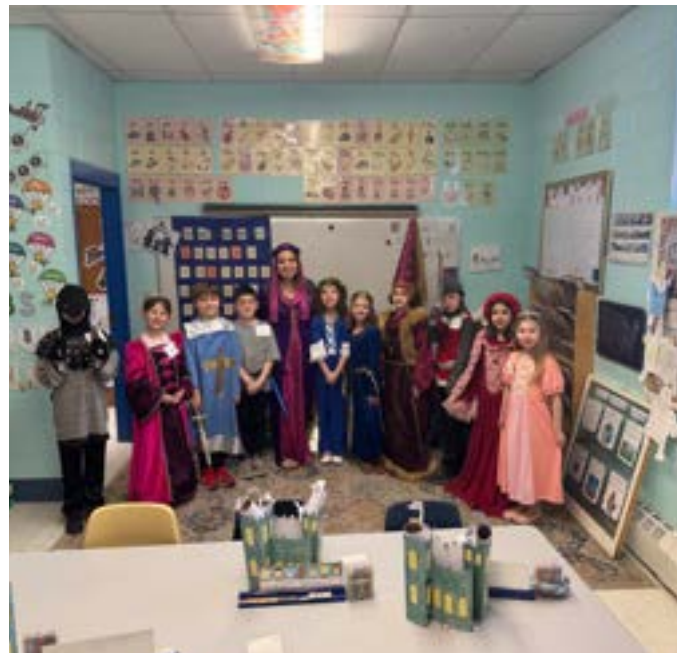
Grade 2 stepping back in time