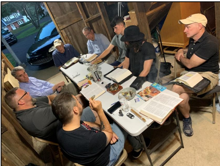
The rough and rustic Ungerman Barn is the meeting space of the Presbyterian Stogie Society year-round.

While the group has both smokers and non-smokers, it is debating whether or not to give up the cigars to see if that will get more guys out.