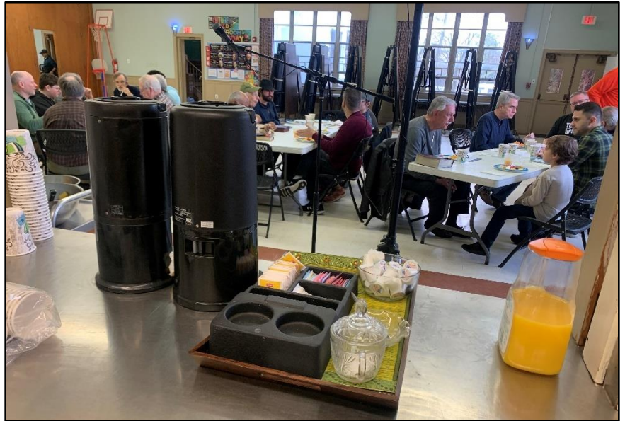
The Boyer Fellowship Hall, viewed here from inside the kitchen, was the scene of the rejuvenated Men’s Prayer Breakfast on March 4.